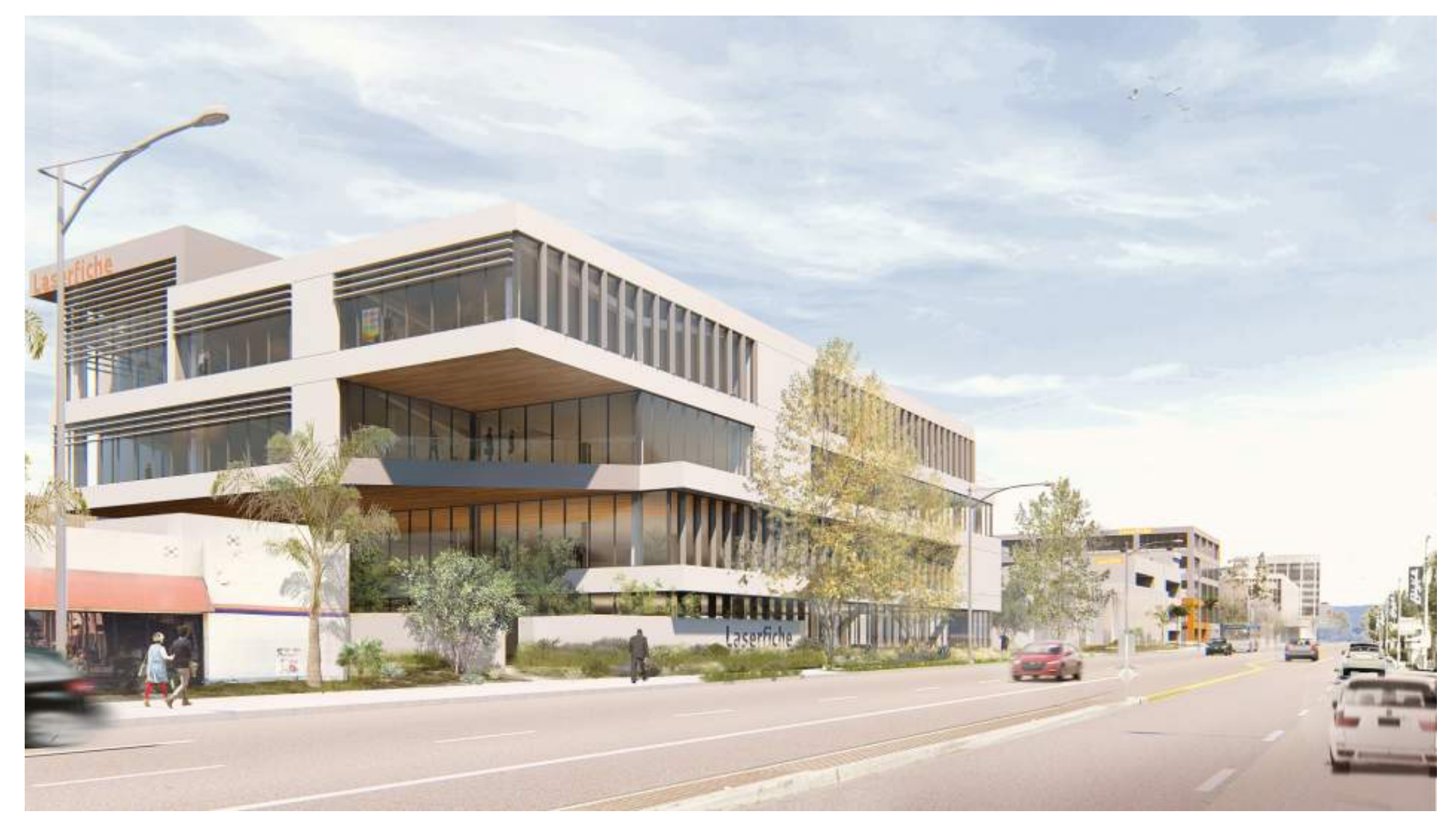
Rendered view looking northwest from Long Beach Boulevard Studio One Eleven

The project, which is targeting LEED Gold certification, was on pace for completion in 2021 at the time of its groundbreaking.