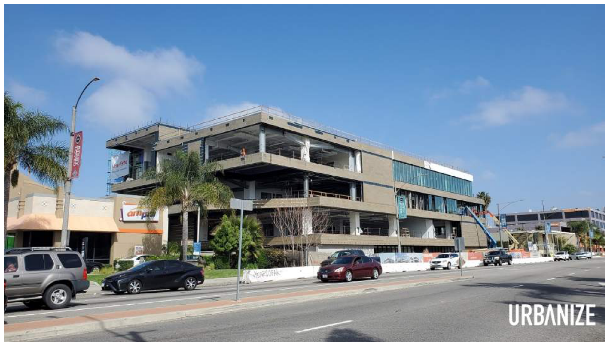
View looking northwest from Long Beach Boulevard Urbanize LA

Nearly a year after we last dropped in, the exterior finishes of Laserfiche's expanded Long Beach headquarters are starting to take form.